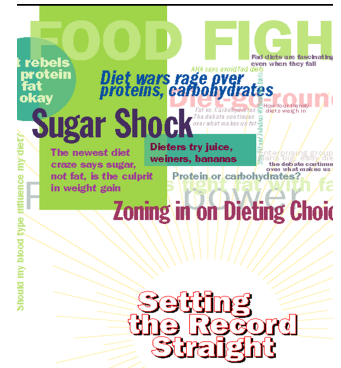
Diet books abound in your local bookstores.

Losing weight permanently is difficult but it can be done. It takes determination, calorie counting, lifestyle changes along with smart food choices.