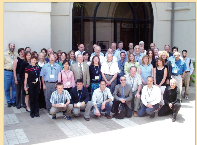
The May 2007 John S. McIlhenny Series of the Pennington Scientific Symposium: “Epigenetic Mechanisms in Obesity: Research & Public Health Implications”

Associate Professor Nuclear Reprogramming and Epigenetics Pennington Biomedical Research Center Louisiana State University System