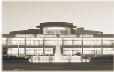
PENNINGTON BIOMEDICAL RESEARCH CENTER LOUISIANA STATE UNIVERSITY SYSTEM

Non-Profit Org. U.S. Postage PAID Permit NO. 664 Baton Rouge, LA