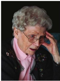
Alzheimer's is a difficult diagnosis for the person and their family.

The incidence of neurodegenerative diseases is expected to grow as the population ages. Many of these, including Alzheimer's disease have been linked to inflammation and oxidative stress. Not only is Alzheimer's linked to oxidative stress but currently at least four genes have been linked to the prevalence of Alzheimer's. Several natural compounds in plants look promising as treatments for diseases such as Alzheimer's disease. Many plant compounds have been found to be strong antioxidants that reduce oxidative stress in cells including resveratrol, epigallocatechin gallate, genistein and