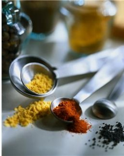
Turmeric is a widely used spice.

Inflammation is caused by the release of chemicals in the cells called inflammatory cytokines. Oxidative stress is the build up of free radicals in cells. Curcuminoids, due to their structure that contains benzene rings and hydroxyl groups, are strong antioxidants and can reduce the concentration of free radical compounds such as hydroxyl radicals, superoxide radicals, singlet oxygen and nitric oxide in biological systems. Eliminating these reactive oxygen species can help prevent LDL oxidation and reduce the risk