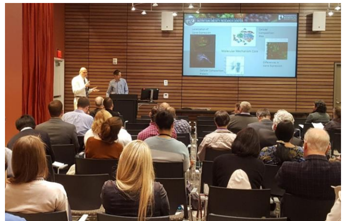
Molecular Mechanisms Core at Obesity Day 2020.